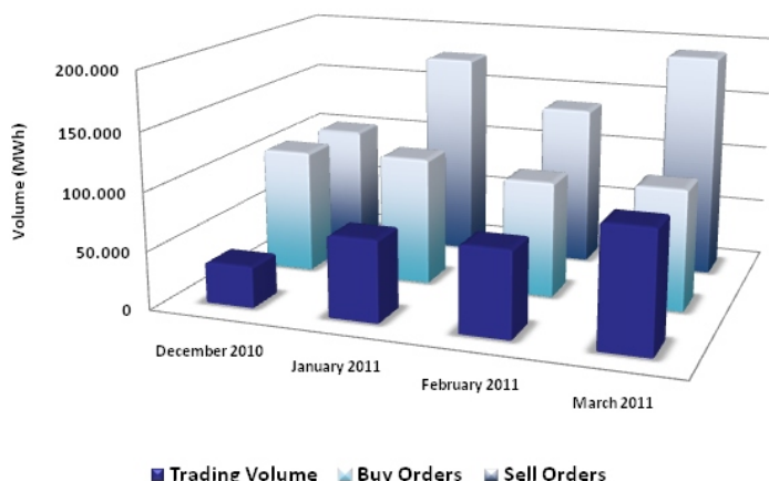
Slovenian Market Auction Prices and Volumes Delivery Day: 01.03.2011 - 31.03.2011